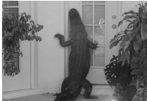
Darn! Lost my keys AGAIN!!