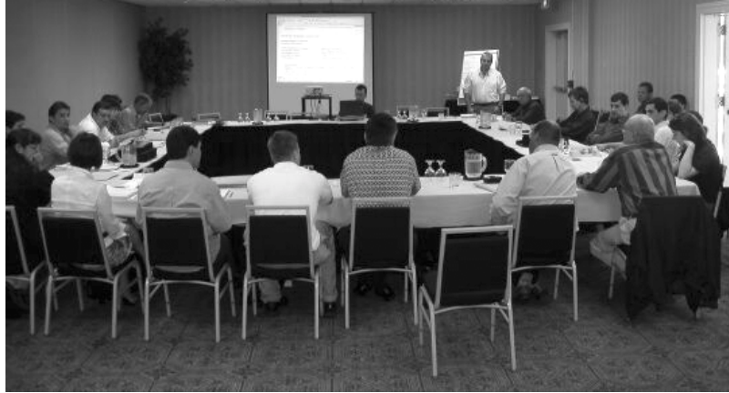
Caiman yacare workshop.

Therefore a general outline of key factors was prepared that each range state could adapt to their conditions and capacity. While this approach may appear overly general, the participants were unanimous that simple and general guidelines would be more likely to be implemented and each representative of a range state national agency undertook to do so.