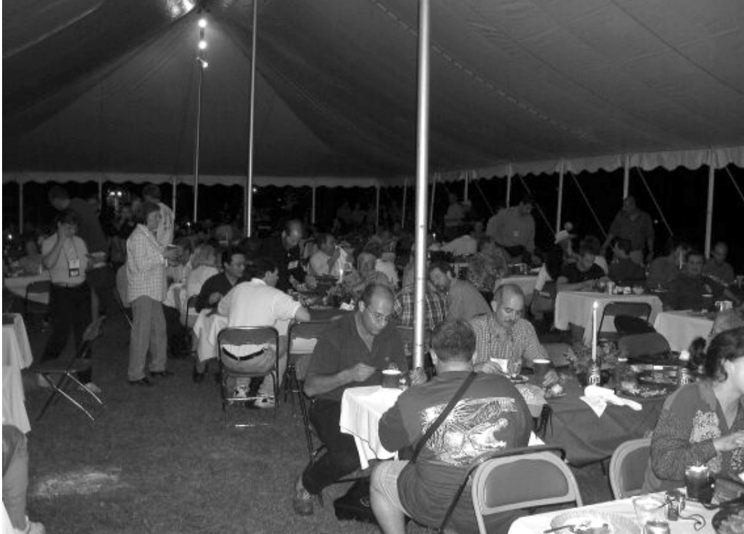
The banquet: barbequed pork, shrimp and alligator enjoyed at Austin Cary Forest.