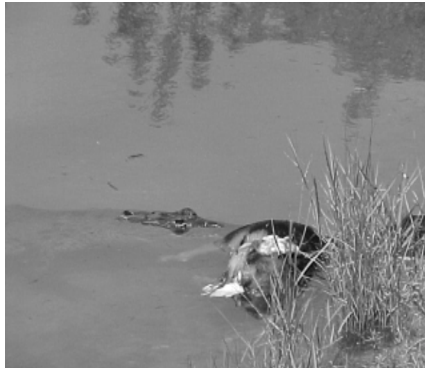
In addition to attacks on humans, loss of pets and livestock are also serious conflicts wherever crocodiles occur.

Ecologically and economically the Nile crocodile is an important species. It is recognized as a keystone species and is the largest species of African predator. In some