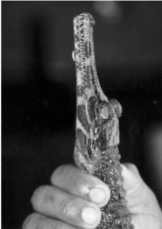
T. schlegelii at Utairach Crocodile Farm, Thailand.

EDITORIAL POLICY - All news on crocodylian conservation, research, management, captive propagation, trade, laws and regulations is welcome. Photographs and other graphic materials are particularly welcome. Information is usually published, as submitted, over the author's name and mailing address. The editors also extract material from correspondence or other sources and these items are attributed to the source. If inaccuracies do appear, please call them to the attention of the editors so that corrections can be published in later issues. The opinions expressed herein are those of the individuals identified and are not the opinions of CSG, the SSC, or the IUCN-World Conservation Union unless so indicated.